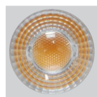
CAMETA LENS High transparency Even light Protect human's eye