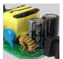
Samxon capacitor ensure good quality